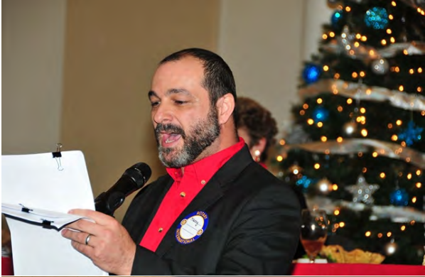
Pictured at left from top to bottom: