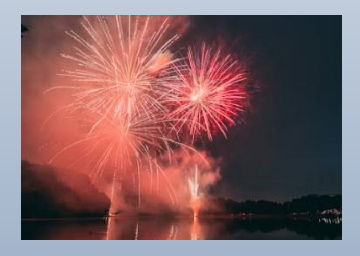
<u> July 11th</u> Inauguration of Mia Harenski</u>